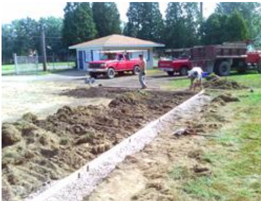
Site Preparation for New Bleachers Summer 2010