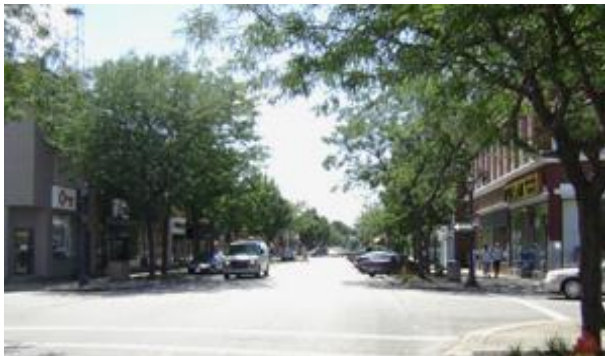
Downtown Conneaut - a friendly small town.

This picturesque Lake Erie coast city of over 12,000 people is growing as a water