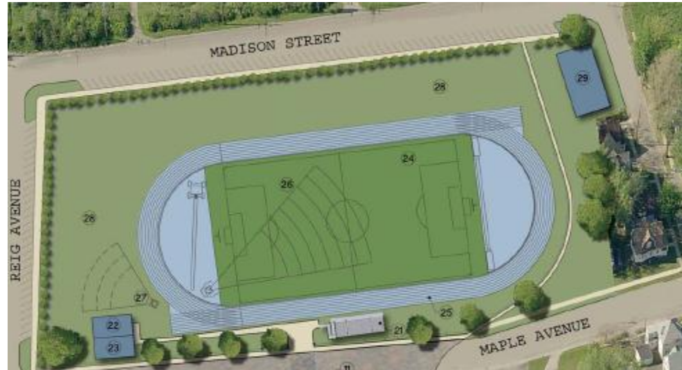
Figure 1: Upper SPARC Campus with 8-Lane Track (25), Soccer Field (24) and Grandstand (21) to be constructed in Phase 2; Field House (29) and Track/Soccer Building (22, 23) in Phase 4; and Practice Fields (26, 27, 28) in Phase 6.