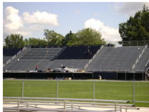
New 1700-seat Home Bleacher Stand --