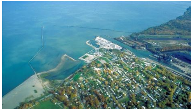
Aerial view of Conneaut's seven-mile shoreline.

Conneaut, Ohio is known for over seven miles of shoreline along Lake Erie with beautiful beaches, boating and great steelhead, perch and walleye fishing. Located along a Native American trail used by Ohio pioneers heading westward, Conneaut became a prosperous village on an extension of the Erie Canal. The word conneaut comes from the Seneca language with one meaning thought to be “a place of many fish.”